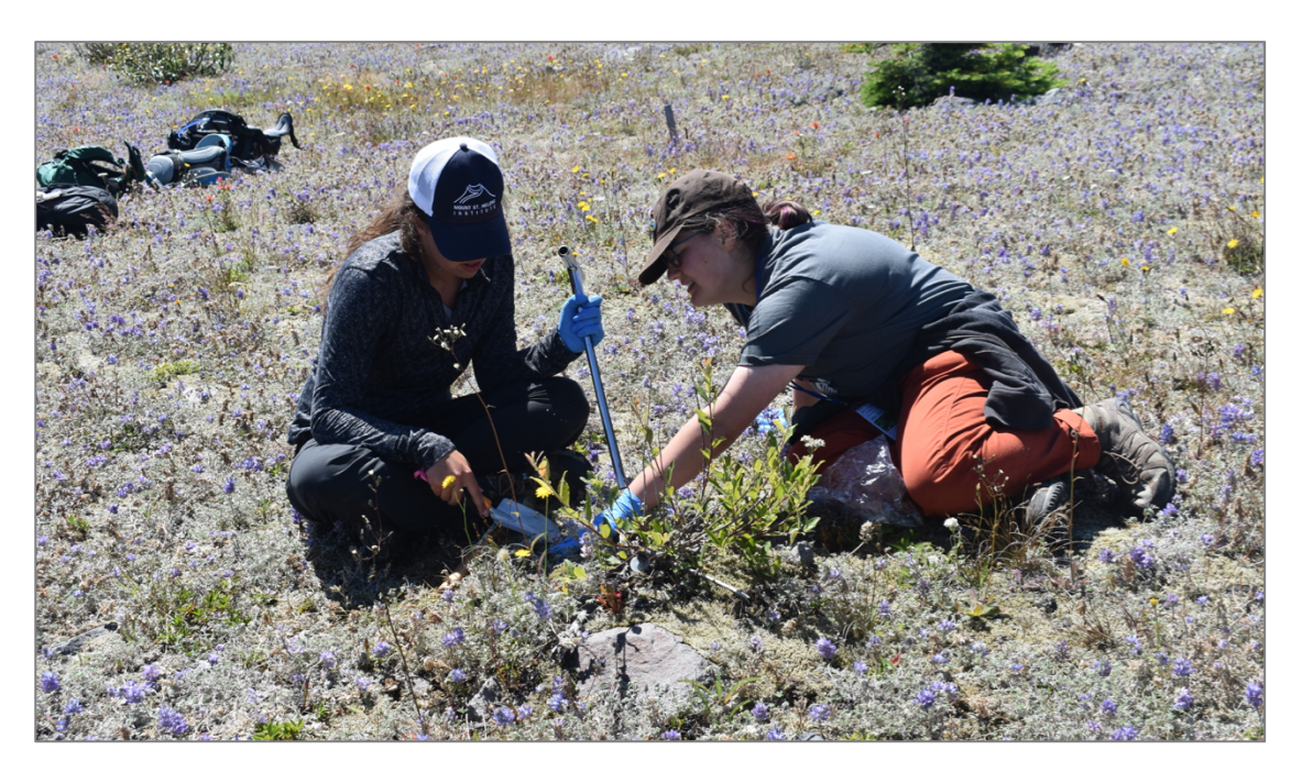
By: Gina Roberti and Abi Groskopf, Mount St. Helens Institute staff

Mount St. Helens is a landscape of change, dynamism and resiliency. As a science educator, I see Mount St. Helens as a place to understand the processes of geological and ecological systems. It is equally a place to allow young minds to explore personal, social and intellectual adventures far from the routines of classroom walls and home towns. In July 2019, high school students from across the United States met in minivans at the Mount St. Helens Institute's rustic field camp as strangers to each other and to this dynamic place.